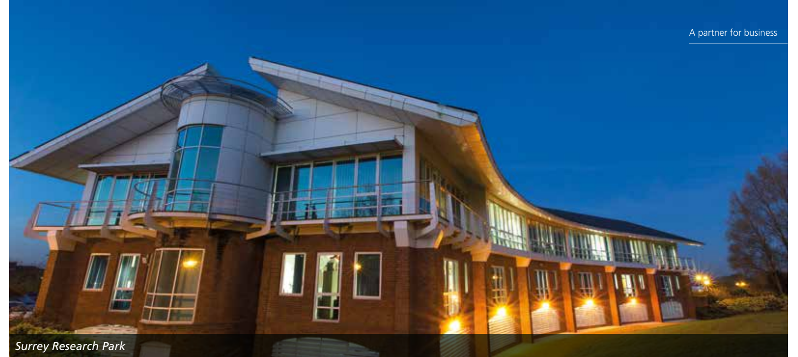
Surrey Research Park

Fourth State began life on campus at the Surrey Space Centre. Applying expertise and techniques honed within the space sector, they've developed a new system to treat a variety of problems including bacteria control, wound healing and cosmetic health.