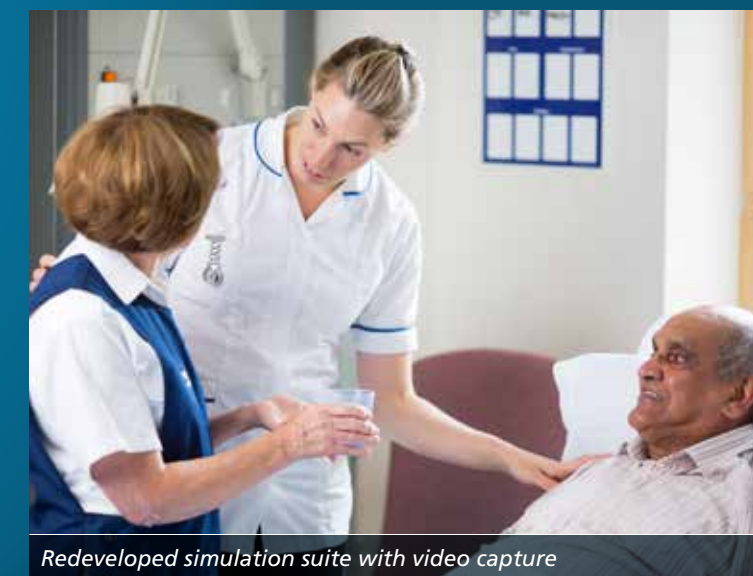
Redeveloped simulation suite with video capture

An important early success of the partnership was the inauguration on 23 October 2015 of a new Post-Graduate Institute for Measurement Science, which will train high-calibre PhD students and provide a pipeline of professionals skilled in the area of measurement science. NPL is already involved in the supervision of over 150 postgraduate students, including more than 35 Surrey students.