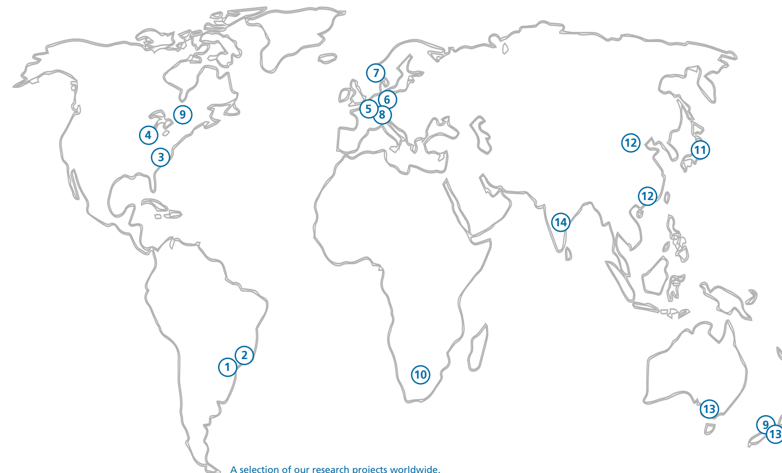
A selection of our research projects worldwide.

10. North-West University, South Africa Staff from both universities are working on a project looking at cardiovascular disease development in Africans, funded by the Academy of Medical Sciences.