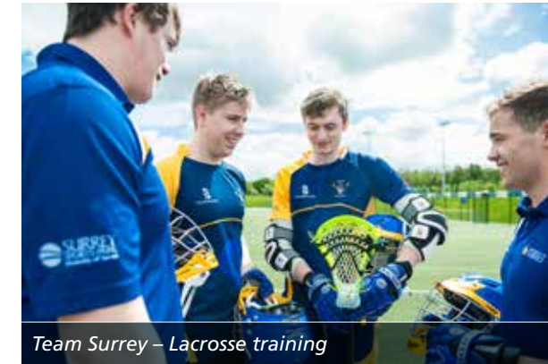
Team Surrey – Lacrosse training

"Encouragingly, we have seen a rise in the number of Surrey students volunteering for schemes varying from teaching in schools to helping at sports events. We are now also a licensed Duke of Edinburgh's Award centre, becoming the first Students' Union in the UK to independently run this scheme.