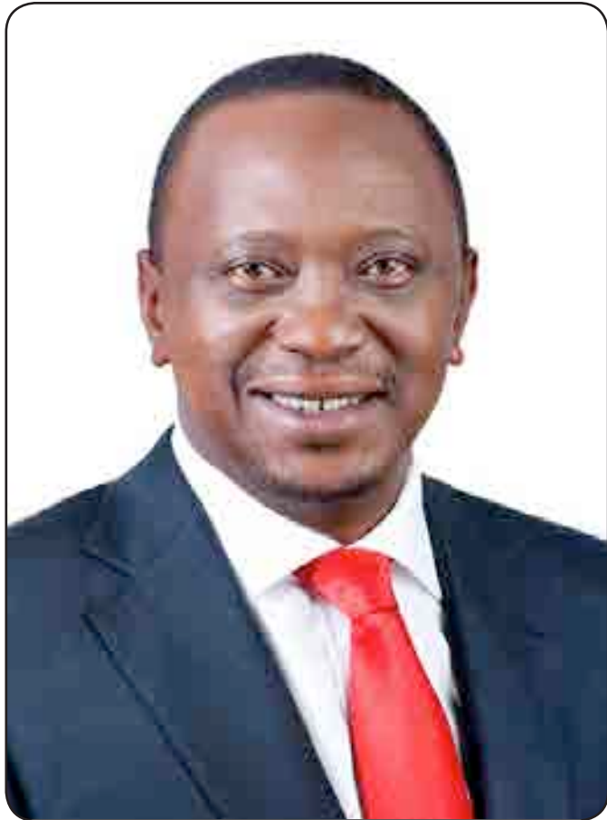
His Excellency Hon Uhuru Kenyatta CGH President of the Republic of Kenya and Commander-in-Chief of the Defence Forces

The security and defence of the people of Kenya and their property is the cardinal function of the Government. To this end, a coherent action plan on defence is contained in this document.