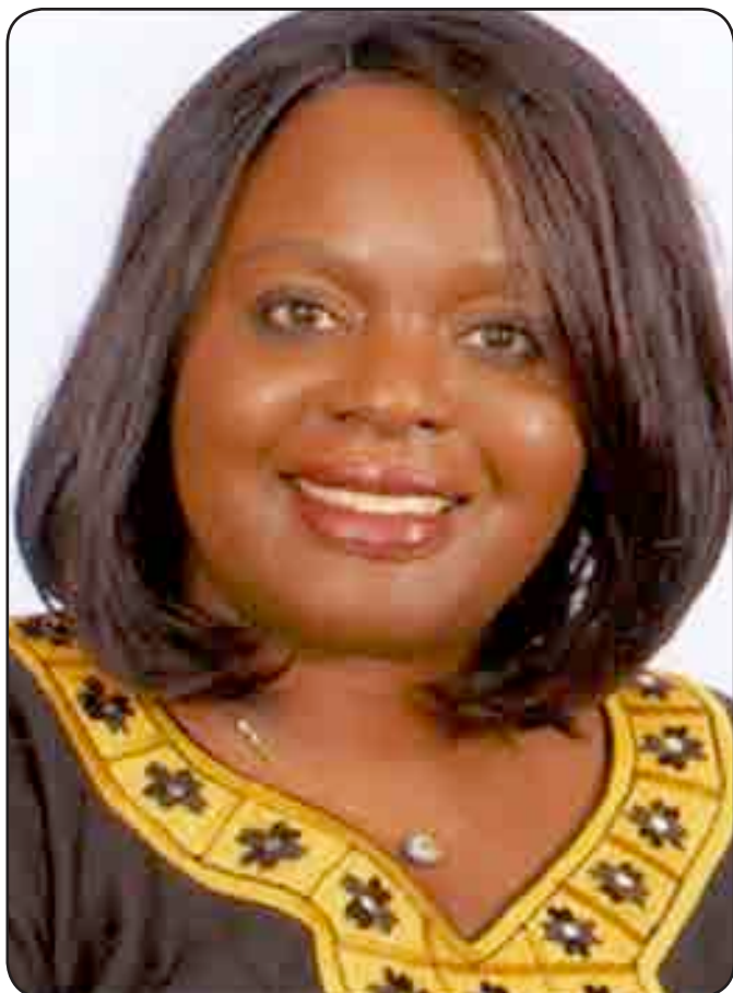
Amb. Raychelle Omamo, SC, EGH Defence Cabinet Secretary

Since independence, Kenya has weathered many a storm and intends to keep guaranteeing the defence of her territory, people and their property. As a nation, we must develop a White Paper to anchor our Defence Strategy.