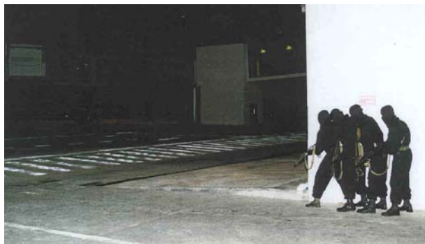
Soldiers from 911 th Airborne Brigade are conducting counter-terrorist techniques.

Since the RCAF has been given roles to ensuring security and social orders, the enhancement of a state of readiness against any possible consequences is prudent. The establishment of a counter-terrorist capability in RCAF's Special Forces would not only provide effective measures to the Royal Government for responses to any hostile occurrences, but it would display quality in defense and promote the RCAF's reputation in national and international circles as well.