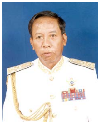
H.E. General Tea Banh Senior Minister Co-Minister of National Defense