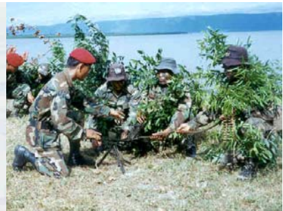
Soldiers from 911 th Airborne Brigade are conducting training.

The three levels of professional training; Cadet, Command and Staff and Strategic Studies; will provide basic and advanced capabilities and experiences to officers at all levels in the RCAF. The recent Seminar on Defense Policy – RCAF Implementation has also demanded that more effort is required in establishing training doctrine, extending language education programs and improving students selection processes.