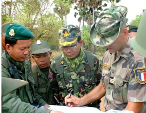
French military cooperation team in support of RCAF training.

France remains an important partner in military cooperation with human resource development, technical assistance to the Royal Gendarmerie and other material support. We hope that cooperation with France would be enhanced in the future, especially in the area of improving the capability of young cadet officers.