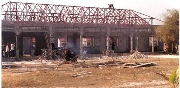
A new meeting hall of the Tmat Pong Cadet School, which is being built, is the donation of the Thai Princess Maha Chakri Sirindhorn.

ASEAN countries, Thailand, Malaysia, the Philippines, Indonesia and Singapore are maintaining their training support. Recently, Thailand has expanded its construction assistance to the Tmat Pong Cadet School, a project of Princess Maha Chakri Sirindhorn.