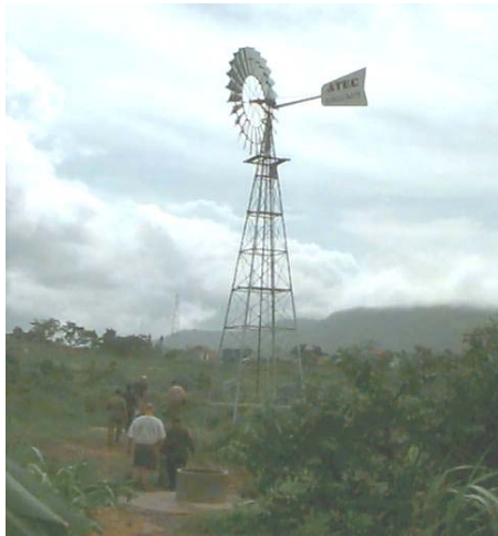
Pich Nil Army Training Center is being assisted by Australia. This windmill supports the Center's daily water consumption.

The RCAF is expecting the return of the IMET program previously provided by the US government from 1994 to mid 1997. Reopening of this program would offer a good opportunity for RCAF officers to enhance their capabilities and expertise which are essential for military reform and force development.