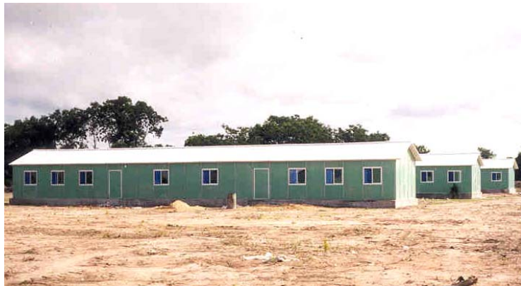
Mobile barracks donated by China to the 1 st Infantry Brigade.

Effective and timely response depends on readiness. Military base permits the concentration of forces, materials, training, condition of service, medical services, morale motivation, disciplines...etc. The Ministry of National Defense and the High Command must have a clear plan for the step-by-step building of military bases, based on available resources. On the other hand, seeking support from foreign countries is essential. Outside assistance is a significant source to achieve good results in construction of military bases.