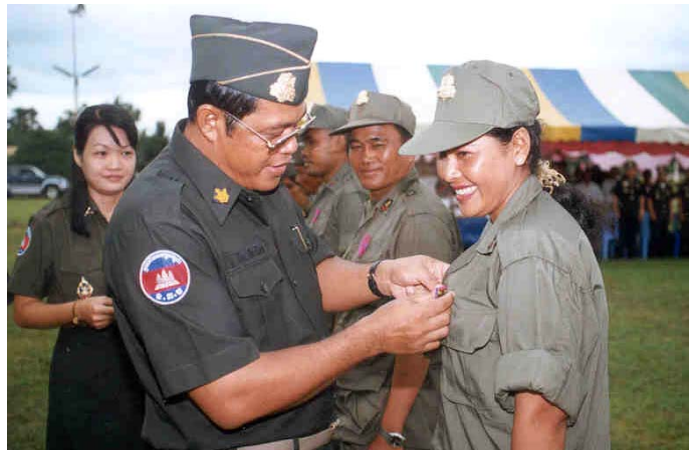
General Ke Kim Yan, Commander-in-Chief of the RCAF, is presenting National Defense Medal to a demobilized soldier.

and 2 were discharged and removed from the military payroll. The Royal Government is planning to conduct the second phase of demobilization in 2002. According to Samdech Prime Minister Hun Sen's remarks while meeting with Belgian and Luxembourg Defense Ministers, the Royal Government wants the RCAF to have an appropriate size that meets current national defense needs while improving soldiers' living standards and transferring funds from security areas to social affairs. Samdech Prime Minister emphasized that the Royal Government will continue to demobilize more soldiers if necessary should the means be available.