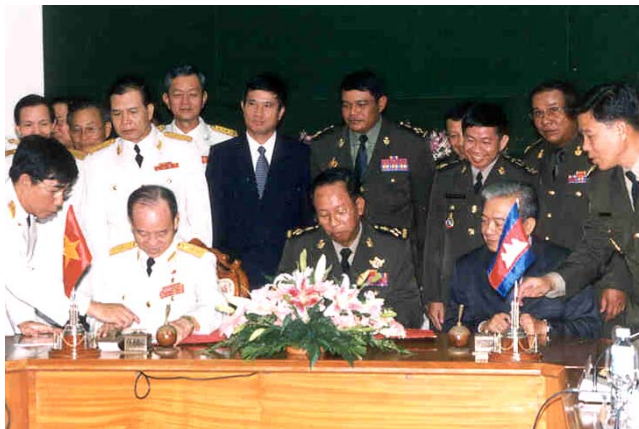
The MoU on military cooperation between Defense Ministries of Cambodia and the S.R. of Vietnam was signed in Phnom Penh by the Defense Ministers of the two countries in late August 2002.

Defense cooperation in six substantial areas is being established with Vietnam. Today and in the future, Vietnam will offer a number of skill training schemes for RCAF personnel.