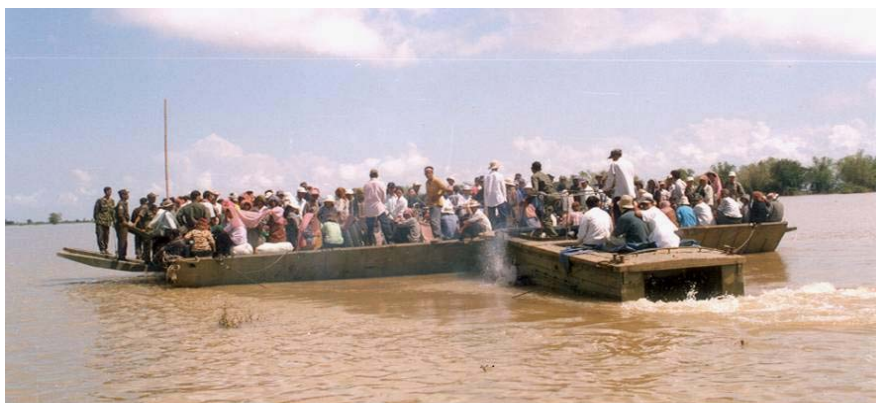
The RCAF evacuates people from the flood affected areas.

As countries enjoy peace and stability, most of the armed forces are putting more emphasis on capability development and allocating resources for humanitarian purpose – disaster relief, medical services and other humanitarian assistance.