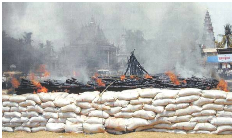
Tens thousands of confiscated and surplus weapons are destroyed under the campaign of "The Flame of Peace". This picture shows the burning of weapons in Kampong Thom in early April 2001.

The campaign to prevent and subsequently eradicate the use of illegal weapons must continue enthusiastically.