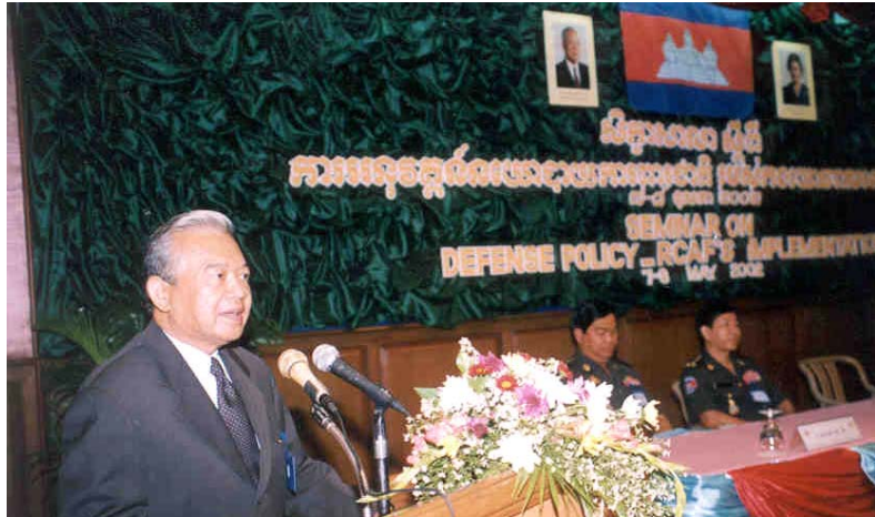
H.R.H. Prince Sisowath Sirirath, Co-Minister of National Defense, speaks to open the Seminar on Defense Policy – RCAF Implementation held from 7 to 8 May 2002.

Therefore, a comprehensive educational campaign of the Defense White Paper and the Defense Strategic Review is extremely important. Moreover, the Ministry of National Defense and the RCAF's High Command should allow military commanders to have the opportunity to meet each other frequently in seminars, conferences, meetings, or in joint planning processes to develop their personal ability, knowledge and vision. It would also provide an opportunity for studies and exchange of experiences that could benefit efforts of building RCAF future reputation.