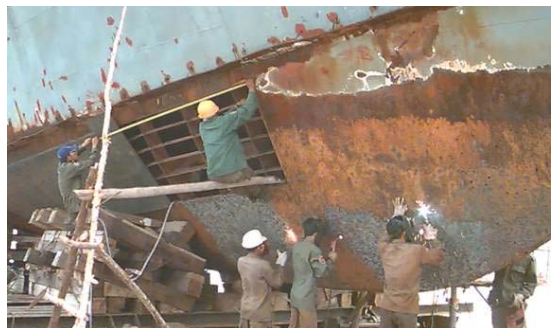
In the state of budget constraint, the Royal Cambodian Navy increases efforts to repair its aging equipments.

Chapter 6 of the White Paper 2000 acknowledges the difficulties in obtaining fund to maintain RCAF's assets. Moreover, the Royal Government's policy has restricted the procurement of additional military equipments for the RCAF at least for the next three to five years. Therefore, all military assets are aging or becoming obsolete particularly due to years of poor maintenance. The Defense White Paper 2000 also underlines the extension of repair and maintenance capabilities to the military regions.