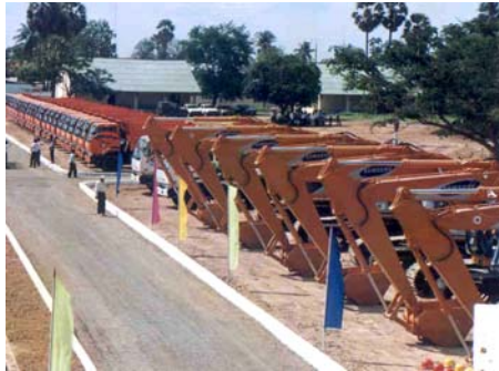
ROK engineering equipment for the RCAF.