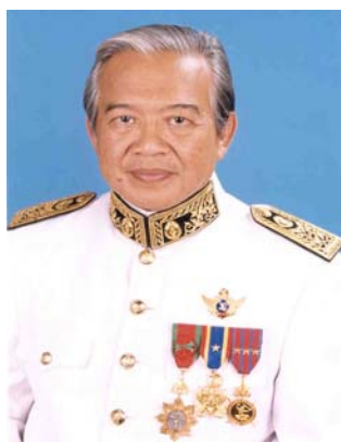
H.R.H Prince Sisowath Sirirath Co-Minister of National Defense

The establishment of a realistic defense policy has inevitably encountered difficulties, but what is infinitely more difficult is the implementation of this policy to achieve ultimate success. This has been to experience to date regarding the implementation of the principles of the White Paper 2000.