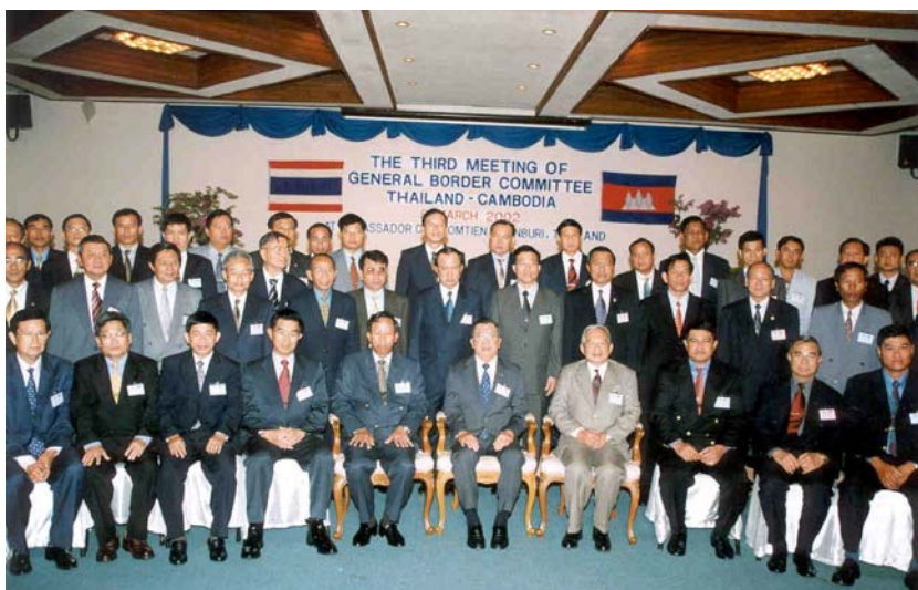
Senior delegates attending Cambodian-Thai General Border Committee Meeting in Pattaya, Thailand in March 2002.

As described in Chapter 3 of the Defense White Paper 2000, Cambodia's security cooperation with its neighboring countries is developing. Cambodian-Thai General Border Committee held its second meeting in Phnom Penh in mid 2001 and the third meeting in Pattaya in early March 2002. Such meetings had been suspended since 1995.