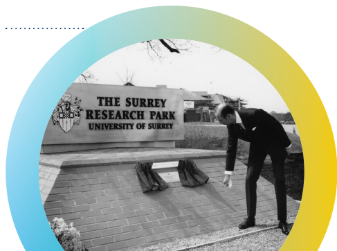
HM The Queen opens new buildings